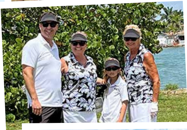
Paradise Golf scramble It was a sold-out event on April 28th sponsored by the City of Treasure Island, PICA and the TI Ladies Golf League. Look for future events at the Treasure Bay Golf Course!